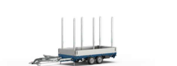
Car and pickup truck trailers