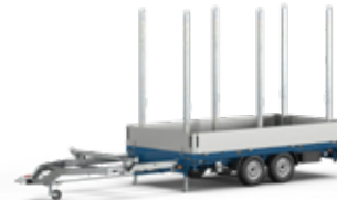
Car and pickup truck trailers