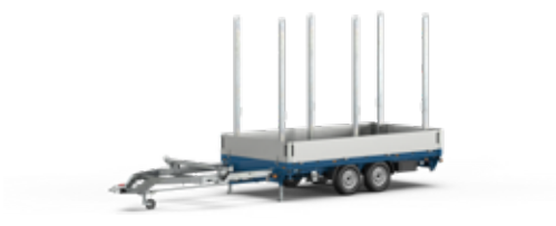
Car and pickup truck trailers